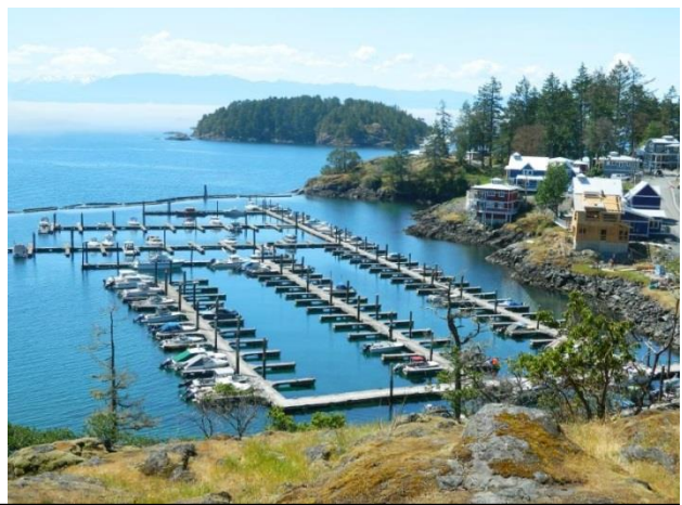
Comparison of fishing boats moored at Cheanuh Marina on the Sc'ianew (Beecher Bay) First Nation Reserve in East Sooke (Left picture taken Jun 2018 – right picture taken May 2019)